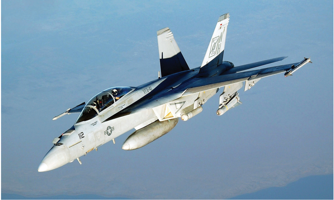
F/A-18 Super Hornet