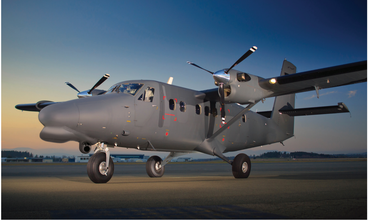
Viking Twin Otter Guardian 400

All Canadians deserve access to credible search-and-rescue services. The Cormorant fleet needs to be supplemented with helicopters of similar capability. The size of that supplement could be anywhere between 5–15 aircraft, depending on whether Canada’s next government retires the model of parachuting first responders from fixed-wing airplanes in favour of long range helicopters, as discussed below. Since the existing Cormorants themselves do not need to be replaced, the best course would be to purchase the latest version of the Cormorant, the AW101, to add to the current fleet. 21