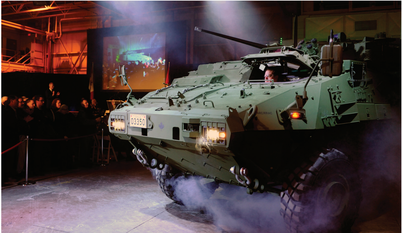
LAV III Upgrade