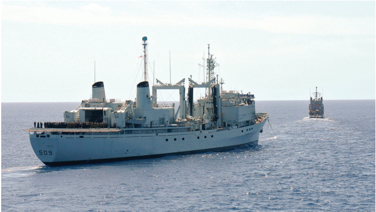
USNS Sioux towing HMCS Protecteur in March 2014

Others involve the rapid completion of long-delayed procurements, including supply ships for the Royal Canadian Navy and rifles for the Canadian Rangers. Further recommendations, such as cancelling the submarine program, can wait until the foreign and defence policy review is complete.