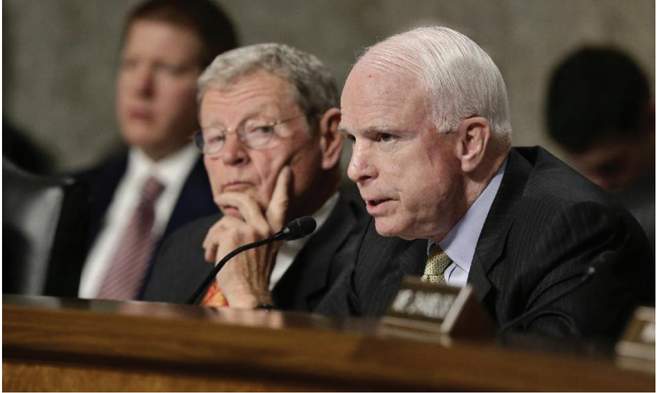
Oversight: John McCain chairs the US Senate's Armed Services Committee

ing together the necessary expertise from military, scientific and policy communities to coordinate third-party reviews.” 72 It took 16 months before the Independent Review Panel was appointed; 73 the establishment of the Internal Review Panel has yet to be announced.