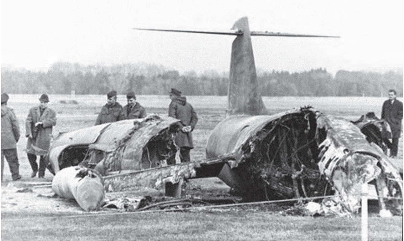
An All-Too Familiar Scene in the 1960s, 70s and 80s: A Crashed F-104 Starfighter

North”. 16 The next month, The Globe and Mail again reported that the F-18 “is preferred by Canadian Forces pilots on the ground that for long Arctic patrols two engines would be better than one.” 17