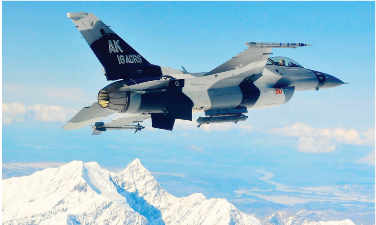
Single-Engine F-16 'Lawn Dart'

crashes is limited, at least 76 and potentially as many as 166 were caused by engine failure. 23 The Norwegian Air Force has lost 16 of its fleet of 72 F-16s to crashes. At least six of the crashes involved engine failures, three of which were caused by bird strikes. 24