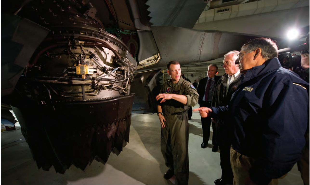
F-35's Single Engine Driven by US Marines' Need for Short Take-off and Vertical Landing

Hostage, the head of Air Combat Command, told the Air Force Times : “The F-35 is not built as an air superiority platform. It needs the F-22.” 39