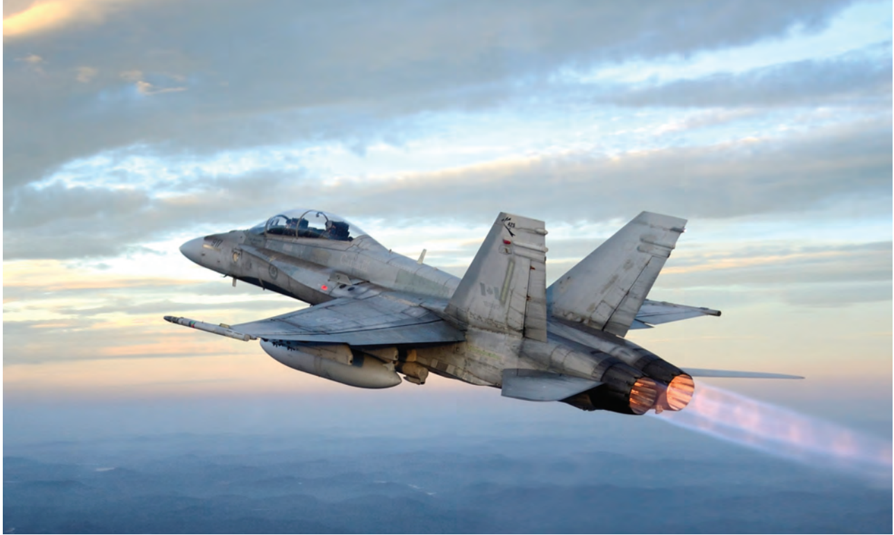
Twin-Engine CF-18 Hornet

a flame-out while on patrol with the F-18, at least you can be sure of getting home on the other engine.” 20 Manson was clear that Canada would have lost more aircraft to accidents had it chosen a single-engine plane: