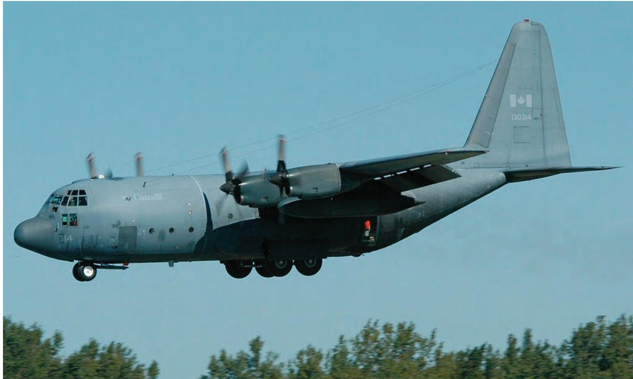
CC-130E Hercules Employed for Search and Rescue in Canada Are Nearly Half a Century Old

Norway does indeed operate F-16s, and roughly half of that country is north of the Arctic Circle. However, Norway's Arctic is considerably smaller than Canada's and much more temperate — thanks to the effect of the Gulf Stream. Additionally, Norway has much better infrastructure than Canada in its Arctic, including numerous paved runways as far north as 78 degrees, at Longyearbyen on the Svalbard Archipelago. Crucially, Norway also has excellent search and rescue, including long-range search-and-rescue helicopters positioned in its Arctic, including on Svalbard.