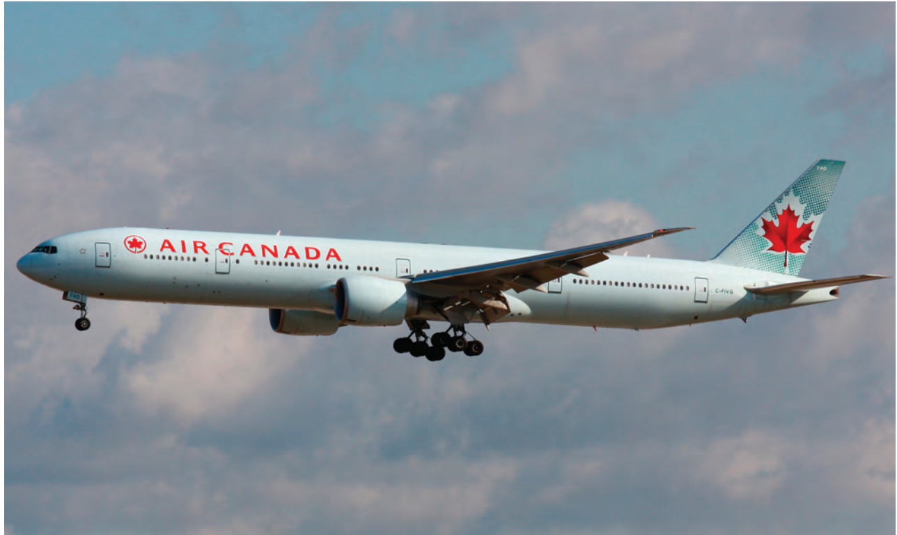
Boeing 777: One of the Safest Aircraft in the World

location, the plane was able to land safely at Anadyr, Russia, 550 kilometres away. 50